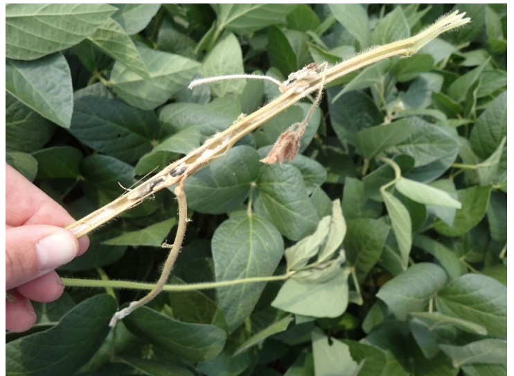
Figure 2. Sclerotia inside of a Soybean white mold infected stem