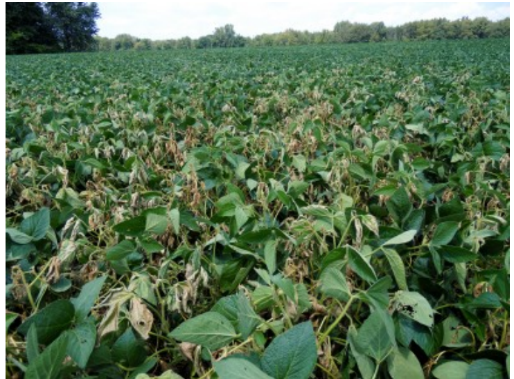
Figure 1. Leaf wilting due to Soybean white mold.